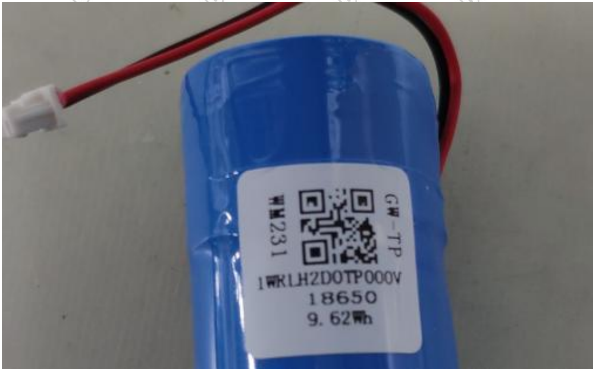
Figure 3 label (电池标签)