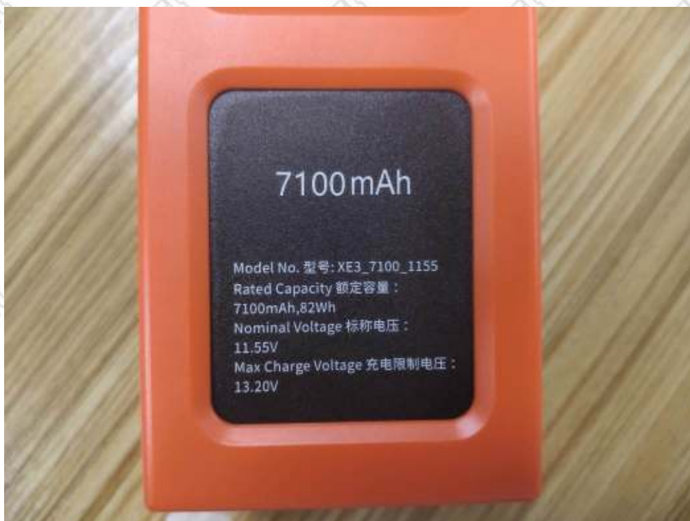
Figure 4 Battery label (电池标签)