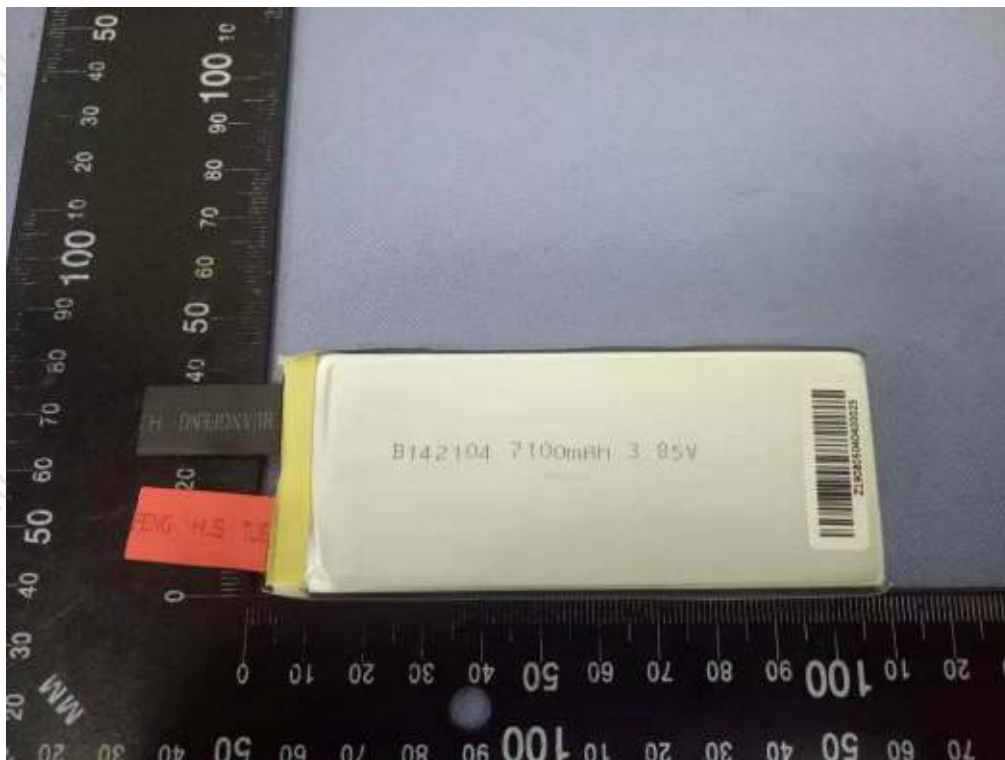
Figure 3 Overall View of cell (电芯图)