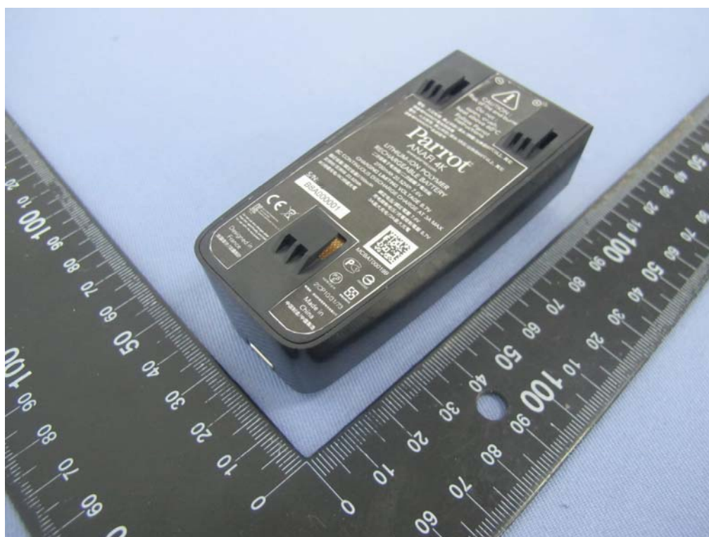
Figure 2 Overall view of II battery (电池外观图II)