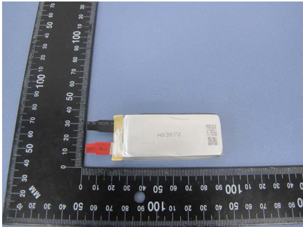
Figure 3 Overall view I of cell (电芯外观图I)