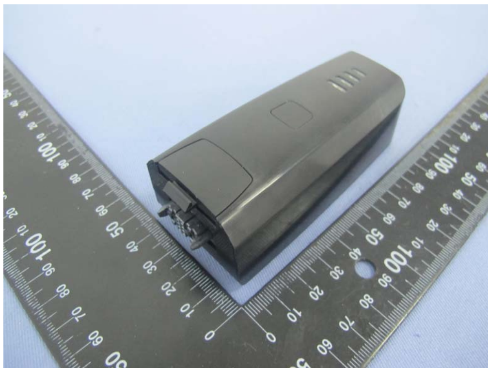
Figure 1 Overall view of II battery (电池外观图I)