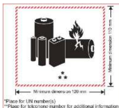
Figure 3 lithium battery handling label

If the lithium-ion battery or cell transported by air the labeling according the requirement of IATA 58th, he packages should paste relevant labeling (refer to item 14.1 the requirement of air transportation); the lithium battery handling label( Figure 3 ) is shown as below.