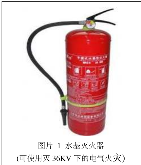
图片 1 水基灭火器 (可使用灭 36KV 下的电气火灾)