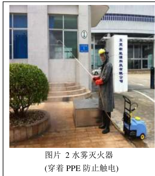
图片 2 水雾灭火器 (穿着 PPE 防止触电)